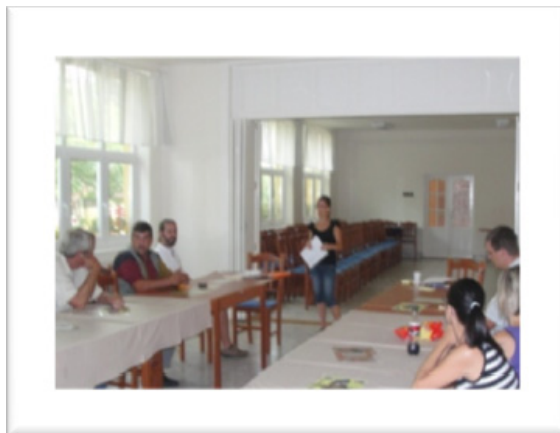
Picture 3. Local Forum

The event was a bottom up organisation carried out by the student. It was advertised through posters and snow ball effect. Finally we had 7 participants, but they were very active. One of the participants after the event wrote in his letter, that he felt disappointed. He thought that they should turn from criticising to be active.