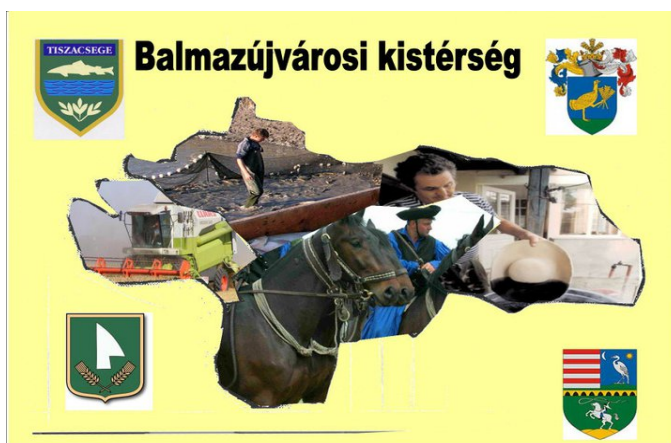
Picture 1. Subjective Atlas of the examined, Balmazújváros LAU1

Results showed that from the seven schools addressed, only two took part in the competitions. It is an interesting result, that children alone, just to win the prizes (for example Aquaticum tickets) did not organise groups and did not take part in the competition. Only those children prepared their map, where there were committed teachers behind. An explanation for the success of the next participatory action could also be the teachers of the local school with whom, along this first action, a good relation was built.