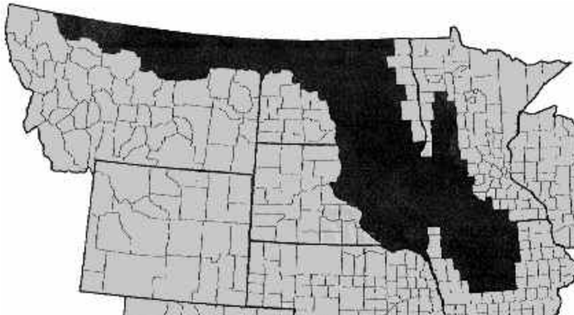
Figure 2. Prairie Pothole Region of the United States

This review of literature focuses on decision-making in the areas of land use and conservation. Narrowly, the intent included identification of research specifically addressing the whole of the Prairie Pothole Region (PPR) (Figure 2). Although none was identified which addressed the entirety of this portion of the U.S. production area, several studies encompassed portions thereof in ways relevant to this review and were included.