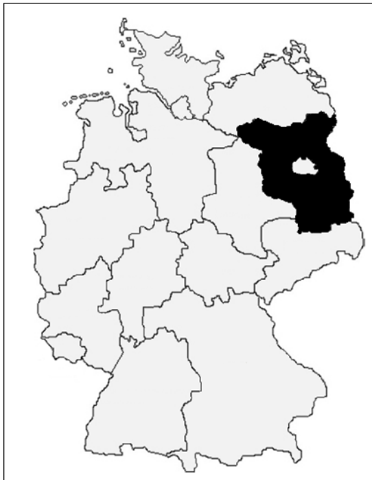
Figure 2: Geographic location of the state of Brandenburg

The state of Brandenburg lies in the north-eastern part of Germany and is composed of 14 counties. Roughly half of the land area is involved in agriculture. Of the entire 1.3 M ha area, 78 % is arable land, 21.5 % is grassland and 0.5 % has a different use.