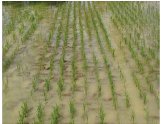
Fig. 10. Flooding can suppress weedy rice emergence and growth

In any rice establishment method, water management is crucial for weed management. Optimal timing, duration, and depth of flooding are critical in managing weeds and weedy rice in direct-seeded rice systems (Fig. 10). Flooding at an early stage, for example, is more effective than flooding at a later stage in suppressing