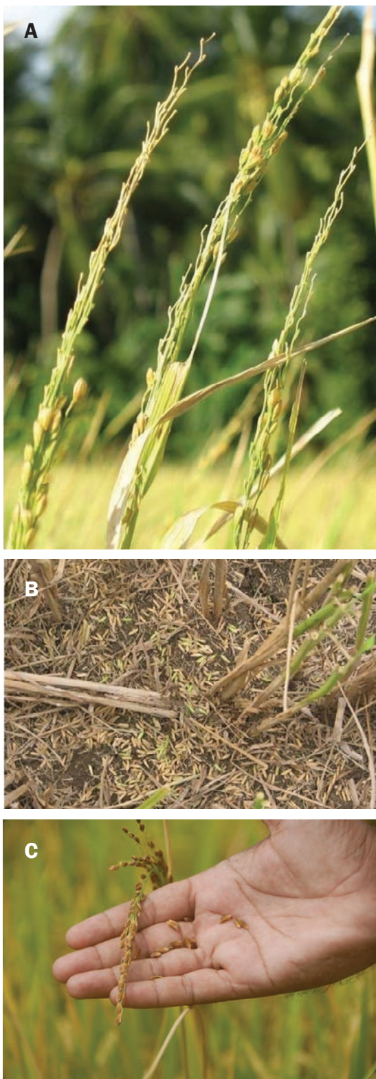
Fig. 3. Early shattering of grains (A & B) and handgrip test (C) for shattering of weedy rice

The growth of weedy rice varies considerably among different biotypes due to differences in plant height, tillering, or leaf-producing capacity. Recently, in the Philippines, compared with weedy rice biotype I, weedy rice biotype II significantly lowered the grain yield of cultivated rice. Such results suggest that different biotypes can affect the grain yield of cultivated rice differently. Some of the important traits of weedy rice are early shattering of its seed (Fig. 3A, B), variable seed dormancy, and high seed persistence in the soil. Weedy rice grains can shatter easily with a slight handgrip of panicles (Fig. 3C); however, grain shattering varies among different weedy rice biotypes. As weedy rice is an annual species and depends on seed production for survival, early seed shattering ensures that a portion of weedy rice seed drops on the soil surface before and during rice harvesting and, in this way, shattering contributes to the persistence and spread of this weed. The seed longevity of weedy rice is generally longer and more variable than that of cultivated rice.