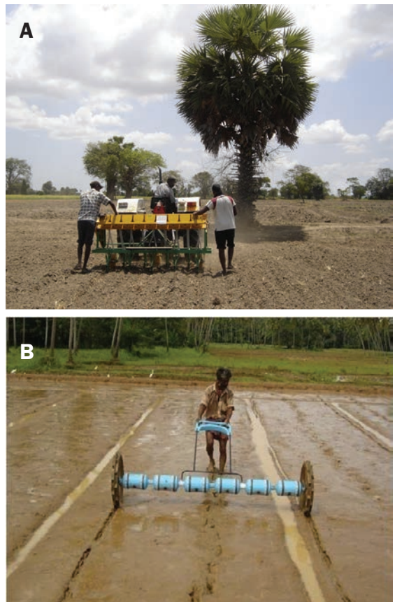
Fig.1. (A) Dry and (B) wet direct-seeded rice

Compared with labor-intensive and puddled-transplanted rice, direct-seeded rice has several advantages, such as being more rapid and easy to sow, less labor intensive, and less water intensive, the crop matures earlier, is conducive to mechanization, and has fewer methane emissions. Weeds, however, are the major problem in direct-seeded rice systems, mainly because (1) the suppressive effect of standing water on weed growth at crop emergence is absent, and (2) the size differential between the crop and the weeds is absent.