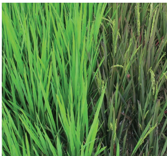
Fig. 8. Purple-colored rice cultivars

The use of cultivars with purple-colored leaves may help to reduce weedy rice infestation and the weed seed bank