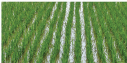
Rice seed lines of weedy rice contamination, good water management and land preparation, preventing weed seeds from entering fields in harvesting machinery, and increased farmer awareness can help control weedy rice.