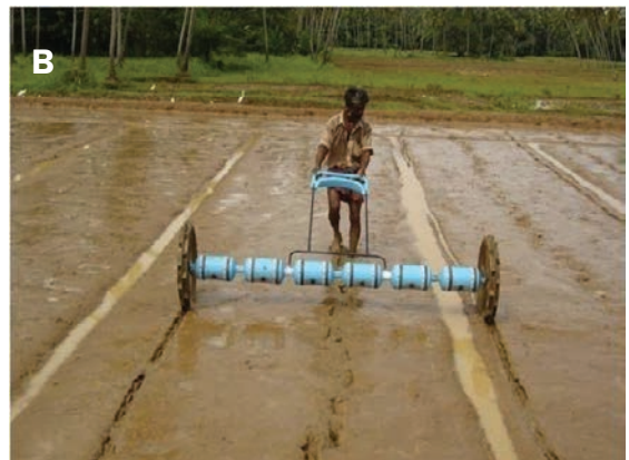
Fig.1. (A) Dry and (B) wet direct-seeded rice

The adoption of direct-seeded systems has increased weedy rice infestation in Asia