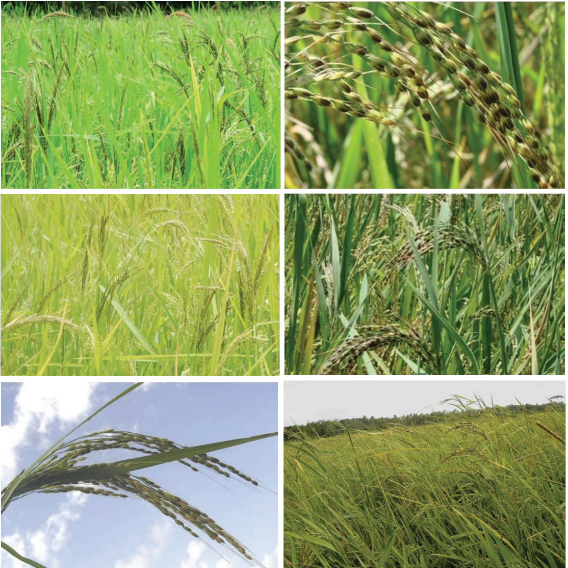
Fig. 2. Weedy rice

makes weedy rice infestation one of the most serious problems that farmers encounter.