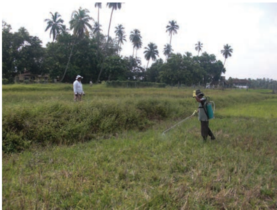
Fig. 4. Stale seedbed practice