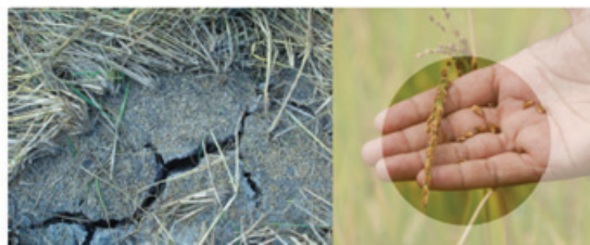
Weedy rice grasses fall easily, and this allows the soil seed bank to build up.

Herbicide-resistant rice: a double-edged sword The use of herbicide-resistant rice varieties and the associated herbicides can improve control of weeds, including weedy and wild rice, and reduce weed control costs.