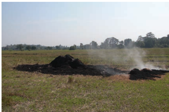
Fig. 5. Straw burning

In some countries (e.g., Malaysia, Vietnam, and Sri Lanka), wet-seeded rice has already been practiced for a long time. Now, growers in these countries face the problem of weedy rice. In direct-seeded broadcast systems, it is hard to differentiate between weedy rice and cultivated rice at the early stages because the rice seeds are broadcast and seedlings of rice and weedy rice emerge simultaneously. The rotating crop establishment method from wet-seeded rice to transplanted rice may help reduce weedy rice infestation. As mentioned earlier, because of the unavailability of labor and/or high labor cost, growers may not be able to hire labor for manual transplanting. However, scope exists for mechanized transplanting using transplanters (Fig. 6). These transplanters are now being used in many Asian countries, including India and Malaysia.