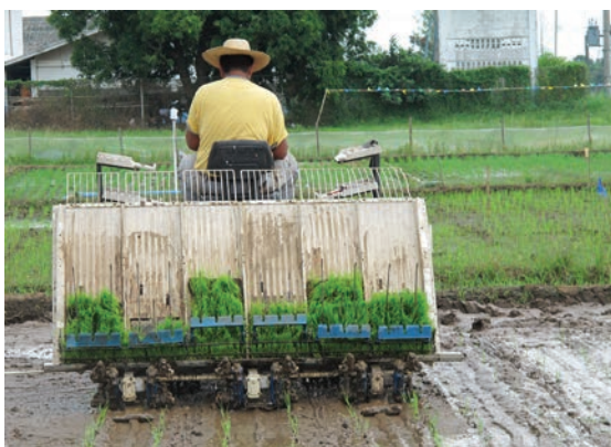
Fig. 6. Mechanical transplanting

In transplanted systems, rice seedlings are more competitive against the newly emerged weedy rice seedlings and it is easy to distinguish weedy rice seedlings from cultivated rice seedlings. Standing water present in the field at the time of transplanting also helps to suppress the emergence and growth of weedy rice seedlings. Growers in many countries, such as Korea, Malaysia, and Vietnam, have been successful in reducing weedy rice infestation by introducing transplanted rice. In many Asian countries, however, there is a need to develop “custom-hiring” systems as many growers cannot afford to buy transplanters. In some regions, for example, in Sri Lanka and Vietnam, seedling broadcasting is practiced in the absence of availability of effective transplanters. In this method, seedlings are grown in a nursery and thrown/broadcast randomly onto puddled soil. Standing water in the field at the time of seedling broadcast helps to suppress weedy rice. In Malaysia, too, seedling broadcasting was found effective in reducing weedy rice infestation.