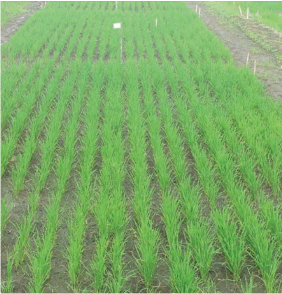
Fig. 9. A row-seeded crop

Wet-seeded rice systems are common in Sri Lanka and Southeast Asian countries and, at present, growers mainly broadcast pregerminated rice seed in these systems. However, wet-seeded rice can also be sown in rows using drum seeders or other mechanized seeding systems. Drum seeders were introduced in Asia a long time ago; however, their adoption is very low because they are not easily available everywhere and growers believe that they are expensive. In addition, growers are not comfortable in pulling a seeder in puddled soil. Sometimes, because of the heavy weight of the seeders, the seed box touches the soil surface and this results in blocking of holes from where seeds fall on the soil surface. Therefore, there is a need to evaluate different kinds of seeders that can be pulled by two- or four-wheel tractors in puddled soils. As mentioned earlier, many growers in Asia have small landholdings and most of them cannot afford to buy seeders or seeding machines. There is thus a need to strengthen custom-hiring systems.