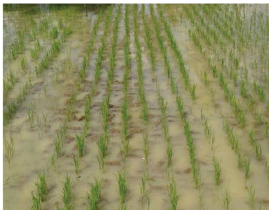
Fig. 10. Flooding can suppress weedy rice emergence and growth

In any rice establishment method, water management is crucial for weed management. Optimal timing, duration, and depth of flooding are critical in managing weeds and weedy rice in direct-seeded rice systems (Fig. 10). Flooding at an early stage, for example, is more effective than flooding at a later stage in suppressing