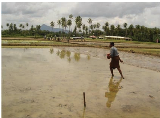
Fig. 7. Water seeding

Water seeding is also being tried in some regions, for example, in Sri Lanka and Vietnam, to suppress weedy rice and other weeds as weed seeds flooded and buried in the soil are not able to emerge (Fig. 7). In this method, pregerminated rice seeds are broadcast in standing water (water 10 to 50 cm deep). Water seeding is different from wet-seeded rice as there is no standing water at the time of seed broadcast in wet-seeded rice systems. At present, however, water seeding is not widely adopted by growers because cultivars capable of germinating under anaerobic conditions are not widely available in Asia.