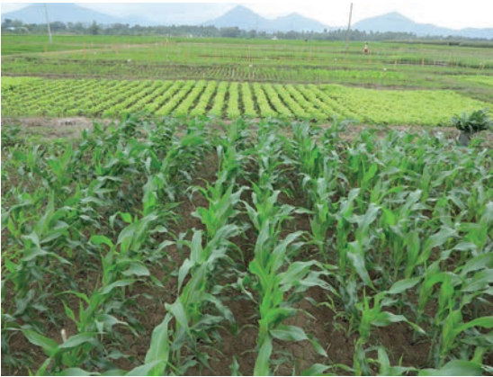
Fig. 12. Rotation of rice with corn or soybean may help to reduce weedy rice problems

One rice crop in monoculture rice systems can be rotated with an upland crop