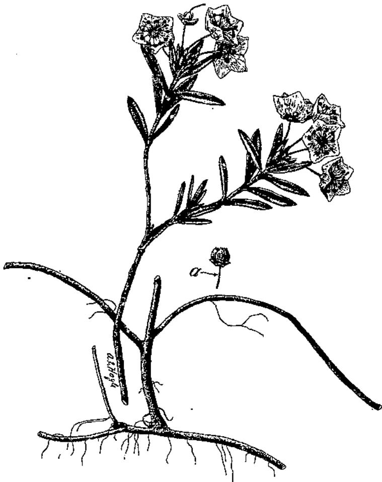
FIGURE 1.—General appearance of alpine kalmia ( Kalmia microphylla ). a, Seed pod or capsule.

Kalmia microphylla ( K. polifolia microphylla ) is a low, branching shrub or bush, from 1 to 12 inches high, growing from an underground stem and belonging to the heath family, the Ericaceae. The leaves, which have short petioles, are nearly oval in outline, although, because of a tendency to roll along the edges, they often appear very