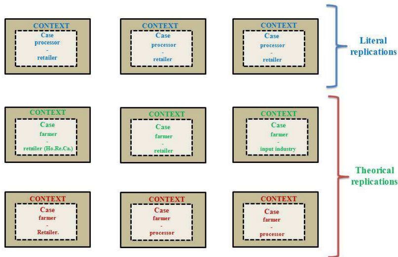
Figure 2 – Holistic multiple case study: literal and theoretical replication