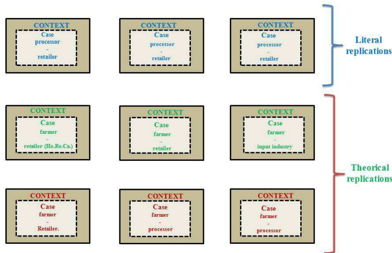
Figure 2 – Holistic multiple case study: literal and theoretical replication