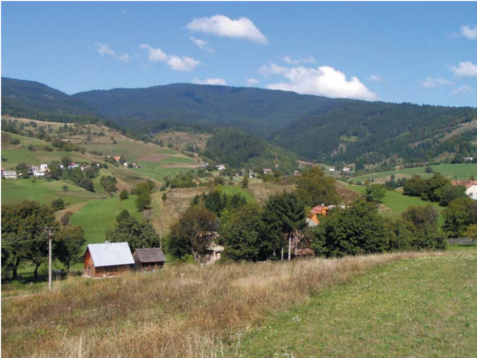
Picture 1. Overview of Poľana BR

plant and animal communities. At present, recreation and tourism do not endanger the ecosystems of the Biosphere Reserve. There is only one recreation centre, with accommodation for 150 people and three sites with a total of 50 cottages, as well as and 20 recreation chalets, with 450 beds. There are also 110 km of marked trails, used by 18,000 tourists a year. Mountain climbing is allowed at selected sites, in accordance with rules discussed with the nature conservation authorities.