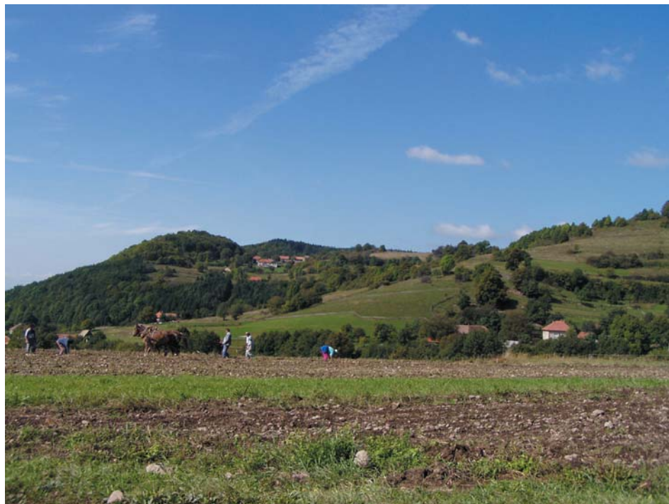
Picture 2. Agriculture activities in Poľana BR