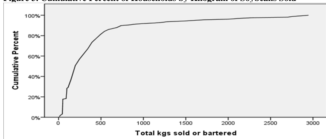
Figure 3. Cumulative Percent of Households by Kilogram of Soybeans Sold