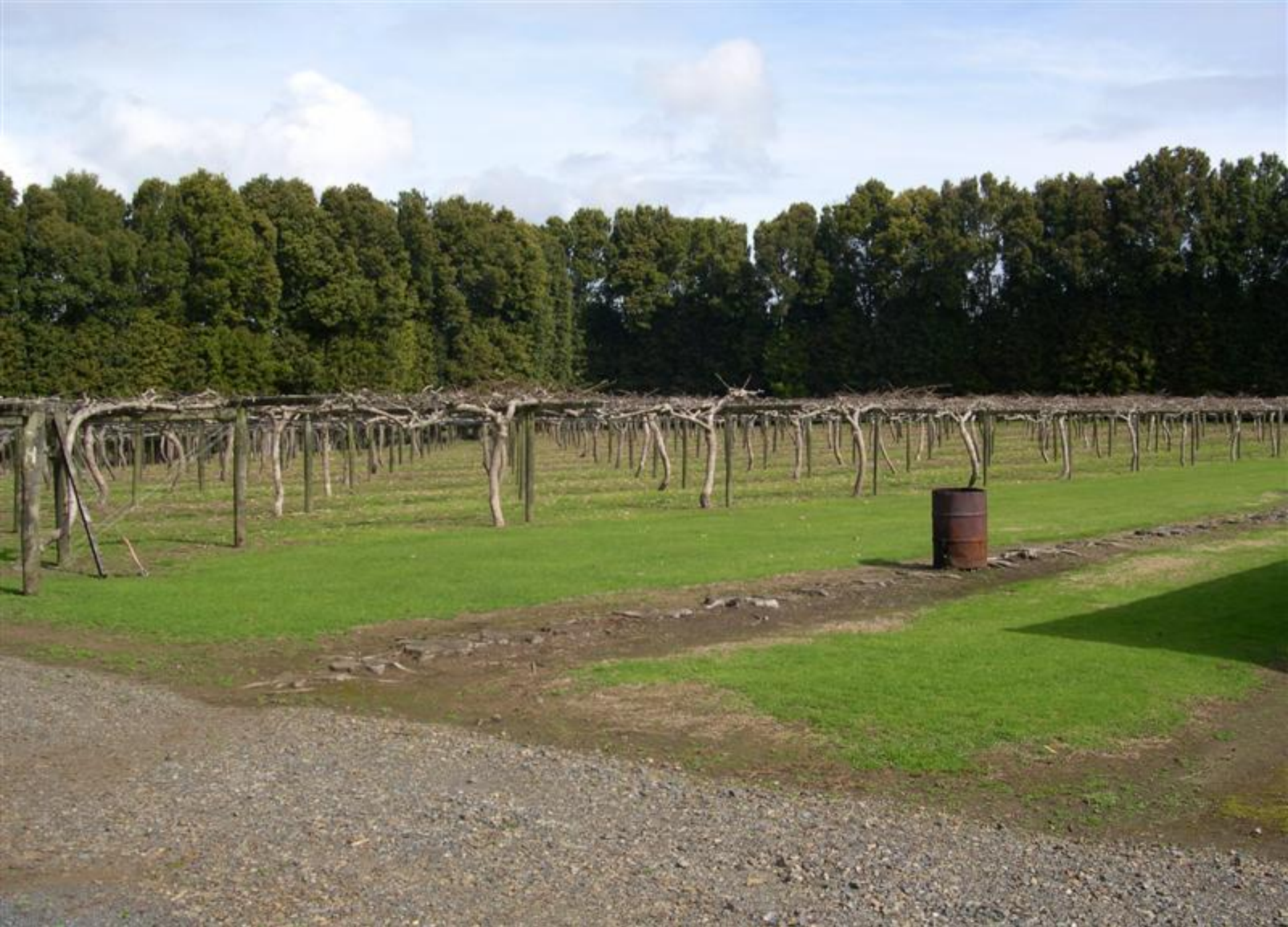
NZARES 28-30 August 2013