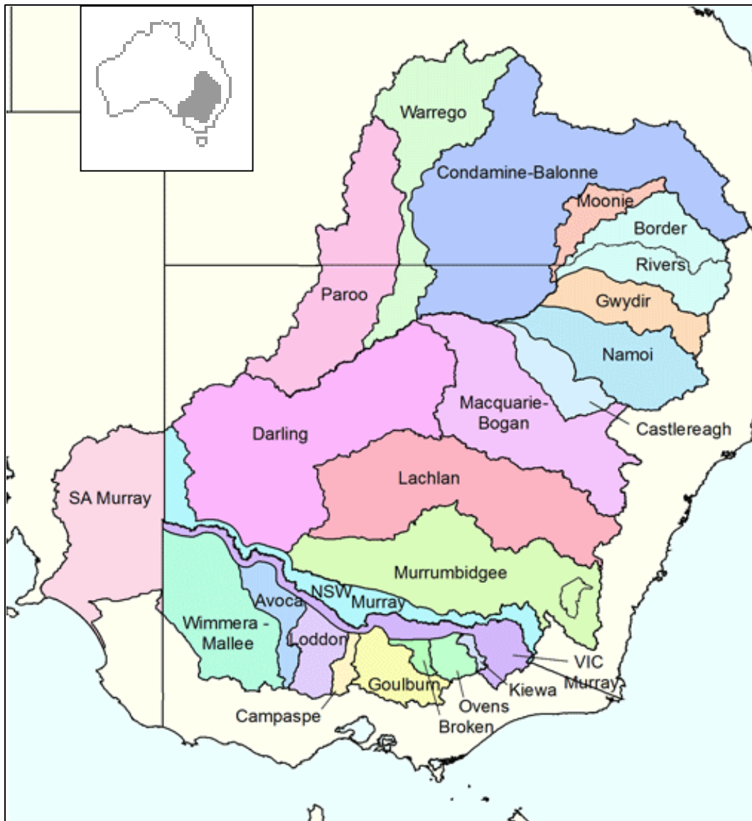
Figure 1: The Murray-Darling Basin and its hydrological catchments

During drought supply conditions we assume all saved water from capital transformation has been applied to perennial horticulture production, resulting in a higher capital level exposure to risk than in the original production function context. Further, where the capital transformation has not increased water supply security, or where the water savings are not used to improve flexibility in farm risk management, then subsequent droughts will result in additional negative capital returns (e.g. the perennial crop asset may be lost). Young et al. (2002) suggest that, over 20 years, water efficiency savings following capital transformation could reduce net (return) flows by as much as 723GL per annum—or 23% of reallocation objectives under the 3,200GL target. Climate change could have