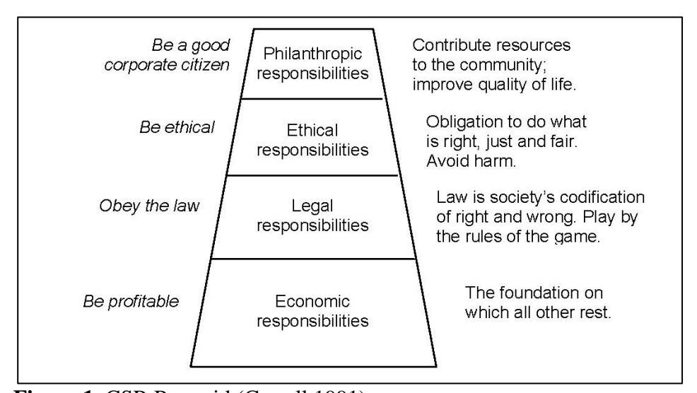
Figure 1. CSR Pyramid (Carroll 1991).

The next influential model of CSR that has held up for decades and has also been supported empirically was put forth by Carroll in 1979 (Visser 2006). Often represented as a pyramid, the concept identifies four key dimensions to CSR - economic, legal, ethical, and philanthropic. The order of the four elements in the pyramid is not random; according to Carroll, they represent the historical evolution of CSR, starting initially with an overarching concern for making profit, which was complemented, over time, with concerns about legal then ethical business practices. The fourth element has been added more recently and it reflects movement towards the idea that above and beyond legal and ethical business practices, businesses have a moral obligation to be good corporate citizens and concern themselves with pressing world problems beyond direct profit. Note that while CSR subsumes parts of sustainability; sustainability is often beyond CSR. Sustainability efforts should go beyond telling outsiders that a company is doing a good job for the society and the environment. Sustainability should provide ways for firms to cut waste and improve efficiencies resulting in smaller environmental or societal footprint (Hawken et al. 1999).