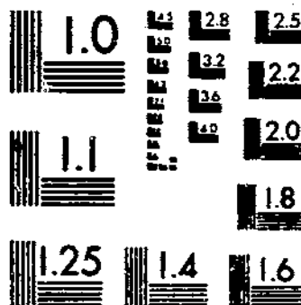
MICROCOPY RESOLUTION TEST CHART NATIONAL BUREAU OF STANDARDS-1963-A