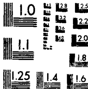
MICROCOPY RESOLUTION TEST CHART NATIONAL BUREAU OF STANDARDS-1963-A