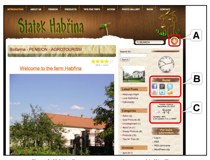
Figure 2: Habřina Farm – a new presentation created in WordPress.