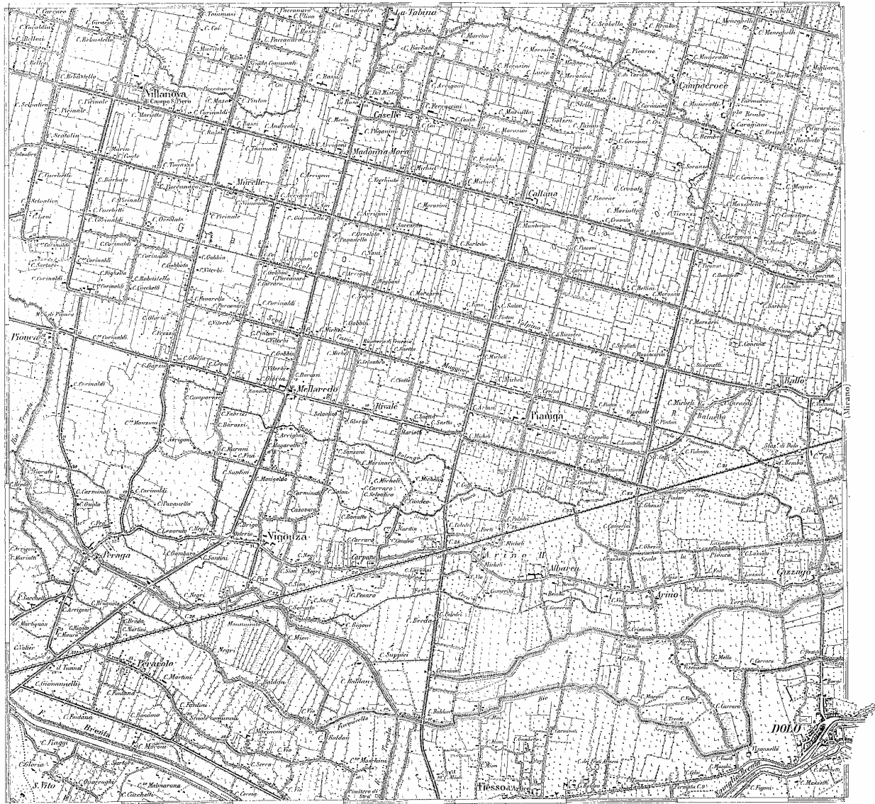
Figure 2 –Plot shape in a roman “centuriation” area

Efforts to make significant parts of the territory suitable for cultivation were taken up again only towards the second half of the 11th century thanks to the religious orders, first of all by Benedictine monks, in various places around the Veneto 3 . By deforesting large areas around the main cities, which were once again beginning to flourish following the profound crisis that took