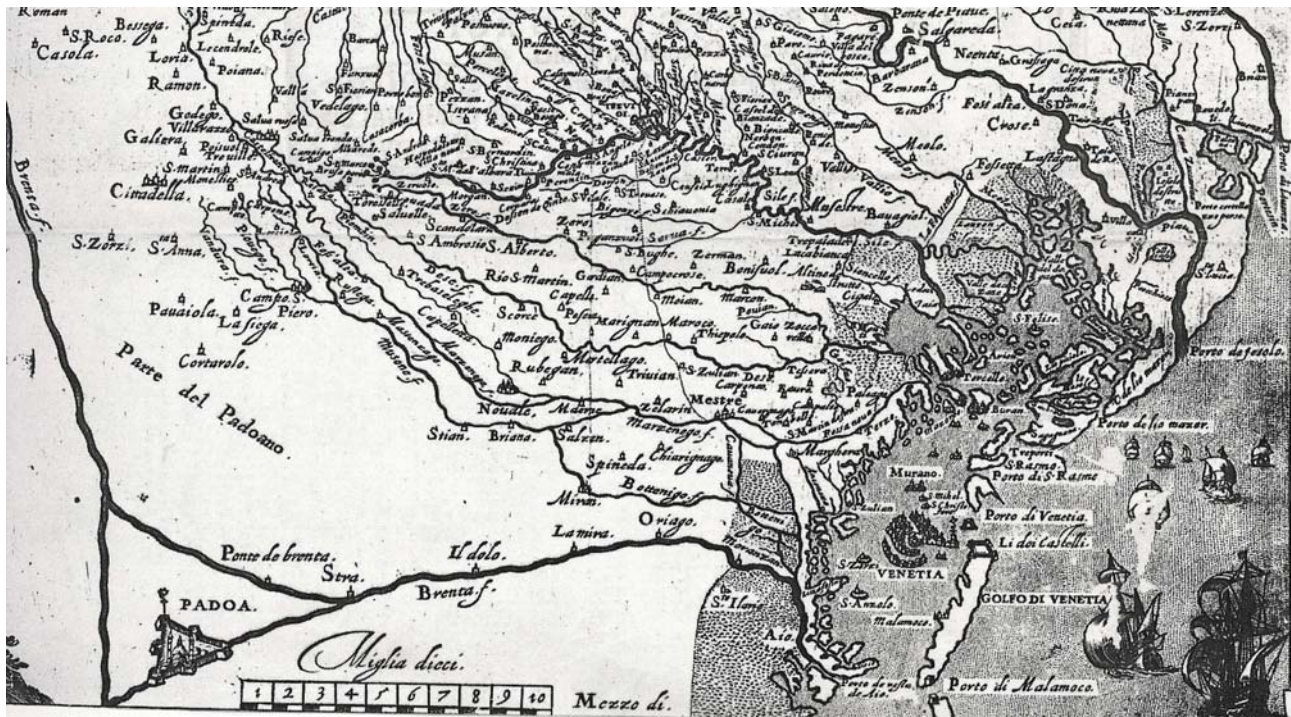
Figure 1 – Venetian mainland before river deviation out of the lagoon

In many areas of the Veneto, signs of the Roman settlements can still be seen, in particular, in the layout of the streets and the square shape of the plots of land called “centuriation” (fig. 2) (Pesavento, 1998). In the ten centuries that followed, because of the fall of the Roman Empire and the constant barbarian invasions, no significant effort was made to protect or maintain the water management interventions that had been carried out in the territory by the Romans so that many were lost and the territory progressively became woods again. This can be explained by the fact that the Longobards, the most important barbarians to invade and settle in the Veneto, were careful to not settle in the middle and lower plains, but rather settled mostly in the foothill plains which were more suitable for hunting, forestry and sheep farming (Varanini, 1990). Human settlements were therefore limited to just a few elevated “islands” and there was certainly less agricultural surface