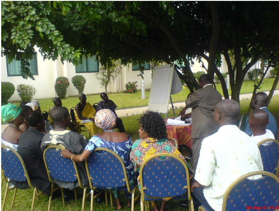
Plate 4: Members of group 4 (Compensation) settled for discussions

To ensure independent work, members settled in their respective groups at different places for commencement of the group discussions. Plate 4 shows settled members of a working group.