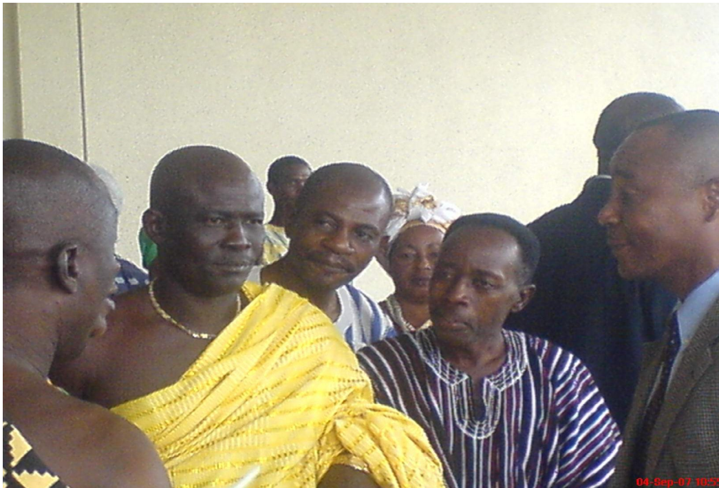
Plate 1: Some participants having discussions at the workshop premises