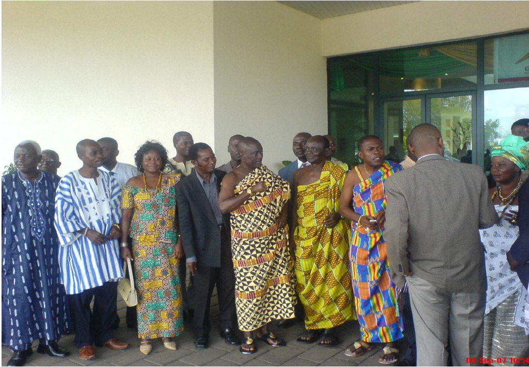
Plate 2: Some participants of the Forum