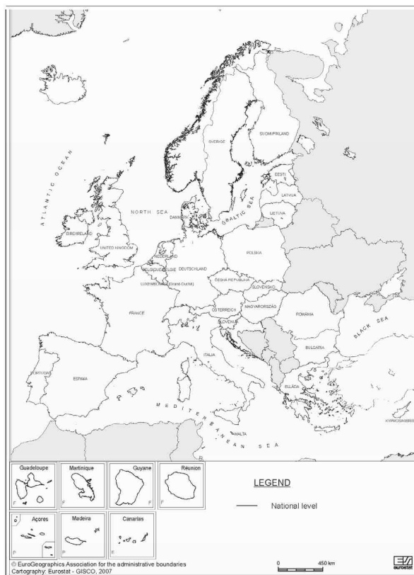
Figure 1 The European Union – National level

As the consequence of 2004 and 2007 enlargement processes, the economic differences even deepened in