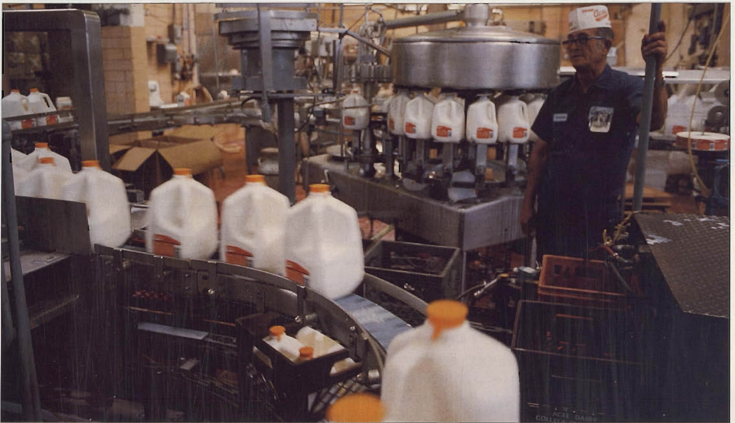
Milk, milk everywhere: The introduction of bovine somatotropin (BST) into an already glutted milk market contributed to the backlash against it.