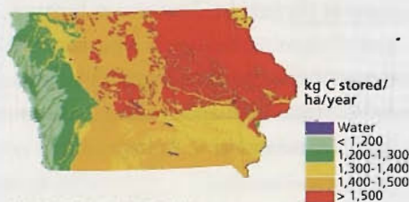
Figure 3. Increase in Iowa Soil Storage Rates with Conservation Reserve Program