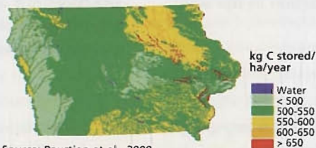
Figure 2. Increase in Iowa Soil Storage Rates with Conversion of Conventional-Till Corn/Soybeans to No-Till

VLC. The VLC system greatly reduces the likelihood of default because for the most part, it is the brokers who will face permit price uncertainty. Given that pri-