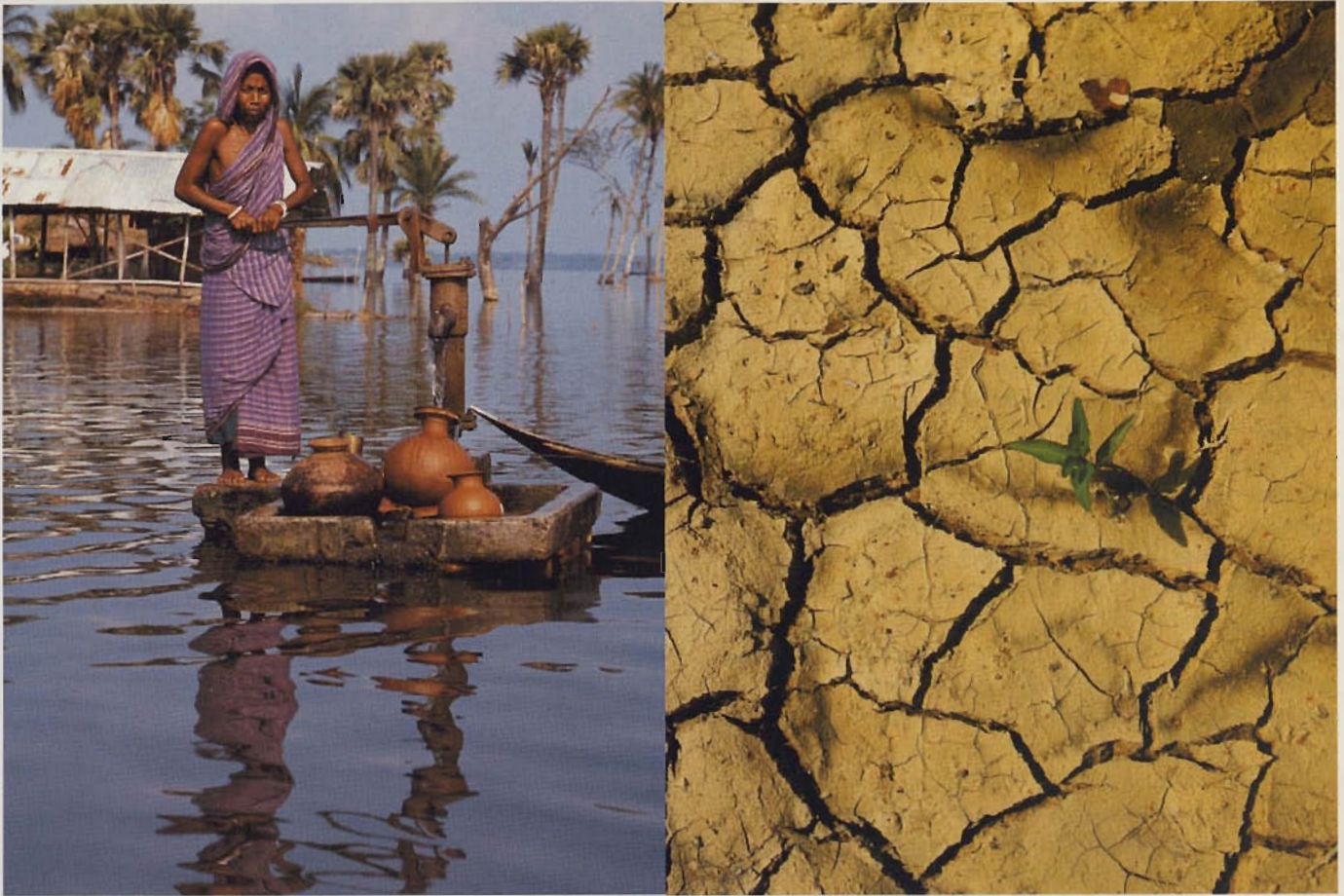
Flooding and drought—the two extremes often associated with global warming. Will farm-dependent communities know how to adapt to changing conditions?

to predict emissions of sulfur as well as carbon dioxide. Greenhouse gases last for decades in the atmosphere, so most of what is in the atmosphere has been there for years; a change in emissions of 20 or 30 percent for a few years does not have much effect on concentrations. In contrast, sulfur compounds last in the atmosphere for a matter of days, so emission cutbacks immediately reduce concentrations. Sulfate aerosols also largely affect regions, cooling areas downwind. Failure to incorporate sulfate aerosols combined with the coarse resolution of GCMs sharply reduces the accuracy of estimates of the spatial pattern of climate change and the temporal pattern, particularly for small geographic areas.