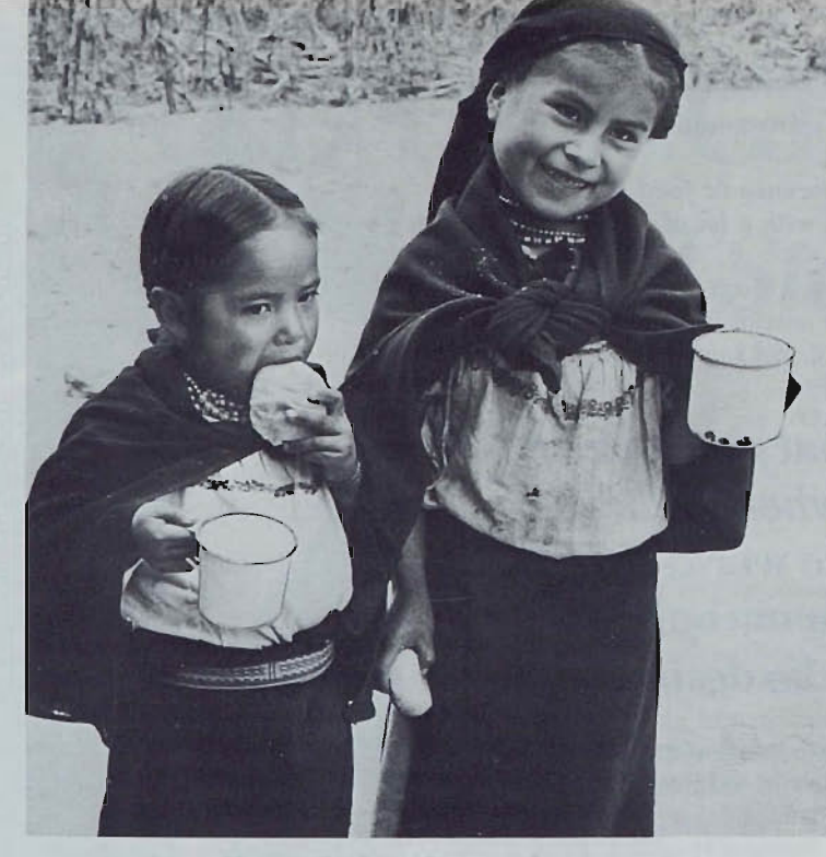
"Is a world of well nourished children worth a once and for all 2 percent increase in your cost of living?"

We need to bear in mind that the people receiving the food stamps would be extremely poor, so poor that they could not buy sufficient food to keep their families alive. One would expect these people to use the stamps to survive before anything else. Granted, there would be some people who would prefer to buy something other than food. They may try to sell the stamps to others who want to buy more food. There is nothing wrong with this; it would be a mistake for a government to try to stop this practice. The harder it is to sell stamps, the greater the discount at which they sell. The poor who originally owned the stamps would lose income in the process. People who are