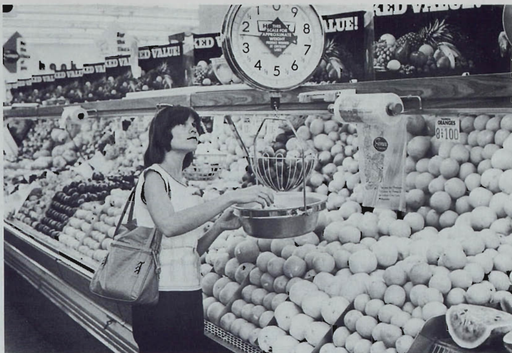
"The 1990 Act was affected by rising environmental sensitivities about resource depletion, water quality, and the safety and quality of the food supply."