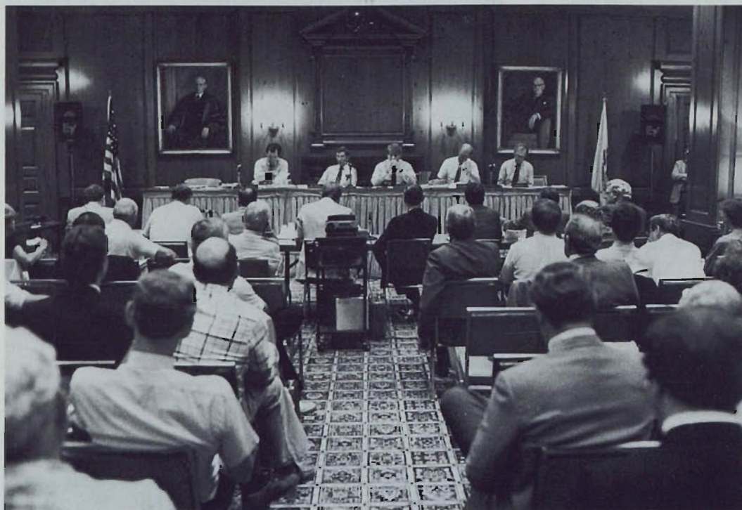
"Participatory political systems use a variety of processes to represent private interests."