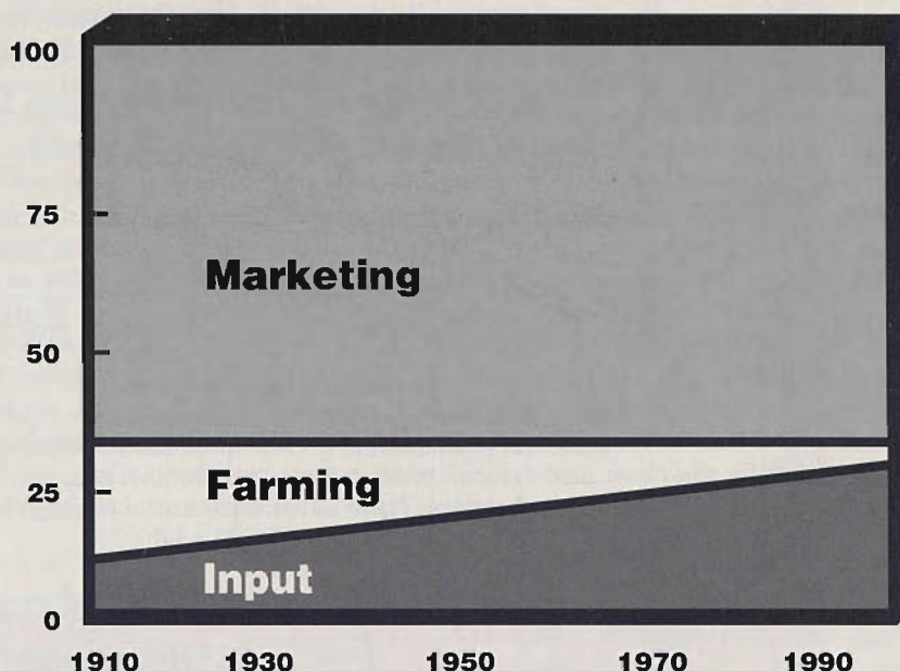
Figure 1 – Component Shares of Agricultural System

Both sides have it wrong. LGU research is not directly scale biased. Instead, it is sector biased. Most agricultural research leads to more nonfarm activity at the expense of farming activities. This shift from farm to nonfarm reduces returns to farmers to cover opportunity costs and requires farmers to either increase production or utilize their excess management and labor in nonfarm pursuits. Indirectly the technology results in fewer and larger farms (in terms of commodity production) and more part time farms, but the direct cause is the sector bias. The scale bias is an indirect outcome.