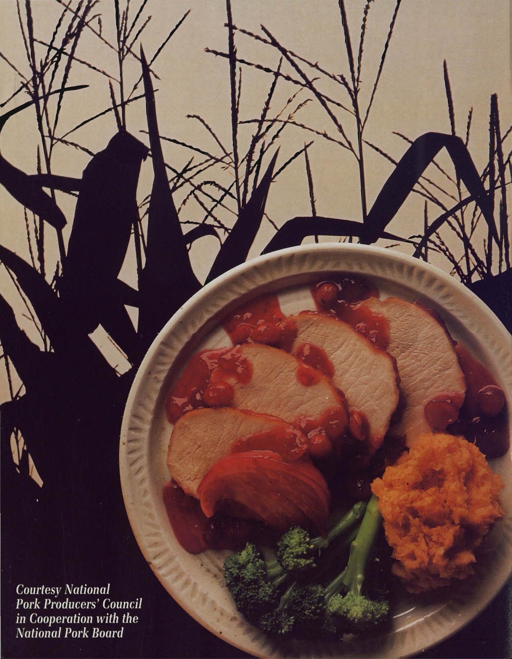
Courtesy National Pork Producers' Council in Cooperation with the National Pork Board