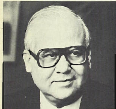
Congressman De La Garza

High on the congressional agenda will be completing work on the trade bill. The 1985 Farm Bill has helped make American agricultural products competitive in the world marketplace. The agricultural export provisions in the House and Senate trade bills will help American agriculture gain access to foreign markets.