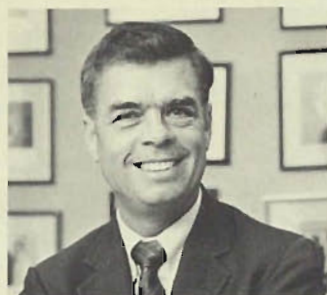
John R. Block

John R. Block is President of the National American Wholesale Grocers Association. As Secretary of the U.S. Department of Agriculture from 1981 to 1986, he had key responsibilities for farm programs, and opening of world markets for U.S. agricultural products. He participated in the highest level of councils and committees of the U.S. Government dealing with farm program, tax, economic, and trade issues. As Secretary, he visited over 30 foreign countries—more than any predecessor. He was raised in Illinois, attended West Point, and farmed in Illinois previous to being appointed Secretary.