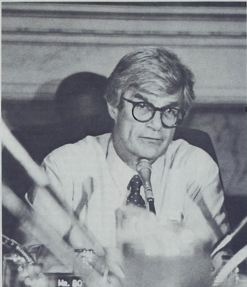
Rudy Boschwitz is Senator from the State of Minnesota.

—The amount of the payment must be known in advance so that the farmer can depend on it. The transition payment, therefore, cannot be like the deficiency payment, which gets smaller as the market price rises above the loan rate. If the payment is not re-