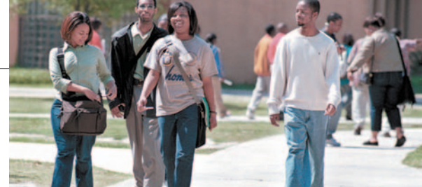
Southern University, LA