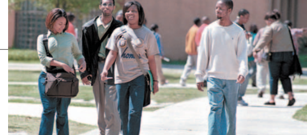
Southern University, LA