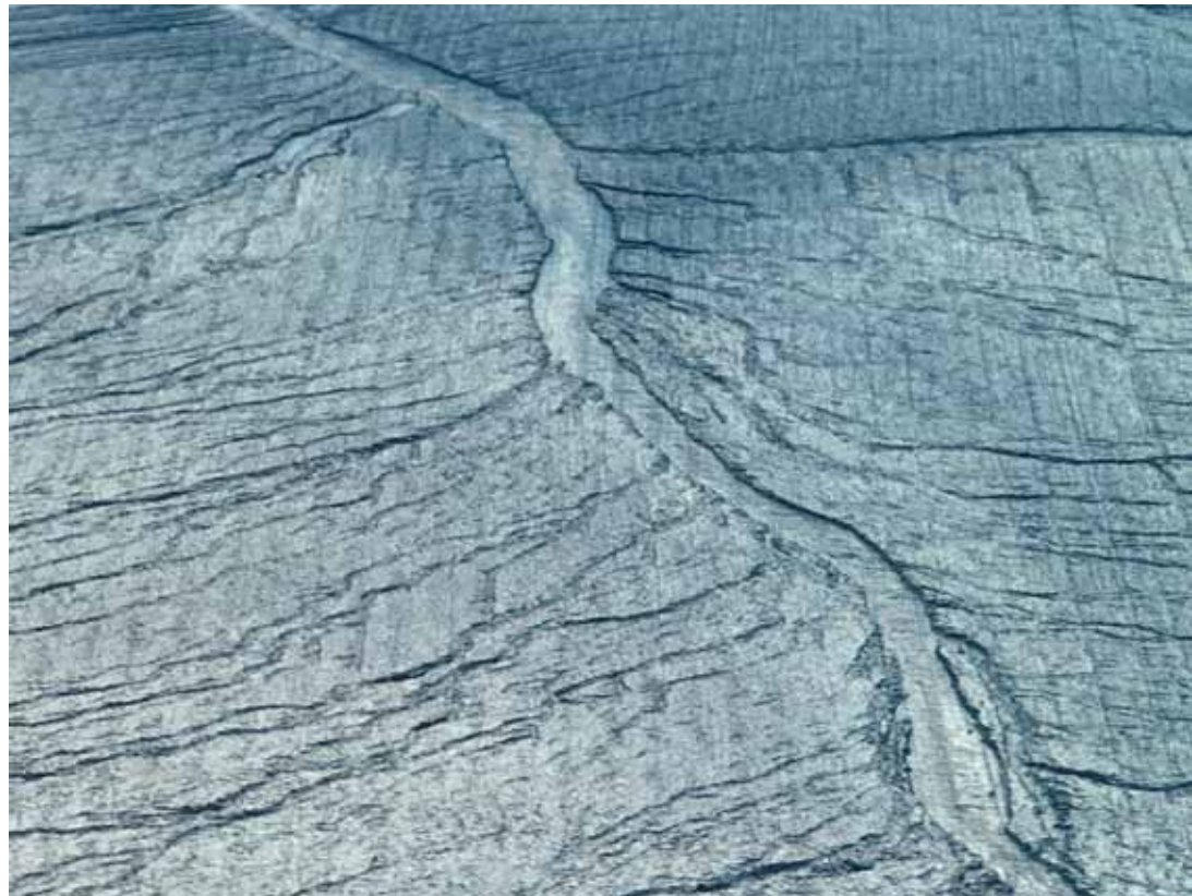
Lynn Betts, USDA/NRCS

A close look at outcomes associated with the Conservation Compliance provision of the 1985 Food Security Act reveals the importance of isolating the effects of the program in order to measure its success. The provision requires agricultural producers to implement soil conservation systems on highly erodible (HEL) cropland to remain eligible for farm program pay-