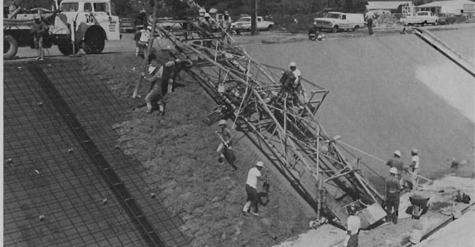
... Use of Construction Skills ...

Along with this changed income perspective has come a change in the enterprise mix. At first, as the farmer commuted to town to work as a carpenter, or truck driver, or his wife commuted to town to work as a school teacher, or in a food processing plant, they continued to produce traditional crops and livestock on the farm—corn, soybeans, cattle, and hogs.