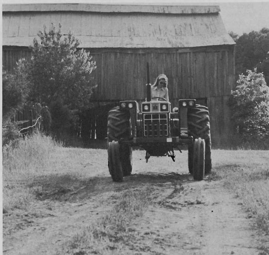
Part time Farming Means . . . Women on Tractors and in the Fields . . .