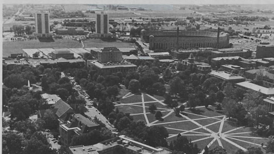
OHIO STATE UNIVERSITY

The main campus of The Ohio State University—a land grant university at Columbus, Ohio.