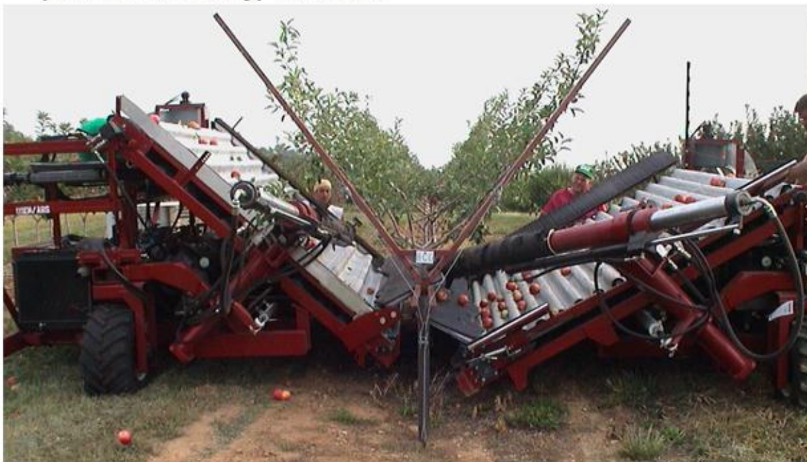
Figure 5. Self-Propelled Mechanical Fresh Market Apple (and Sweet Cherry) Harvester

The new experimental BEI Black Ice Harvester works with delicate fresh-market bush berries—raspberries, blackberries and blueberries. The Black Ice Harvester uses jets of air to create a turbulent local environment within the machine and around the berry bushes, which then gently dislodge those that are ripe. The machine has padded walls, and the berries fall onto a bed or table (the Centipede Scale catching frame) and then are gently conveyed to one pound or smaller containers that are carried on the machine. A major advantage of this machine is that berries and bushes are not touched by a picking or rotating-arm mechanism. This helps minimize damage to ripe berries and scarring of the bushes. With the minimal plant damage by the harvester, the machine can be used to make multiple passes over the same bushes as the berries ripen at different dates. With this machine, fruit quality meets or exceeds that of hand-harvested, and since no human handling of the fruit is required in the harvesting and packing, there are reduced food safety concerns. The machine is being farm tested. Its estimated cost is $150,000 for the smaller model and $200,000 for a larger model.