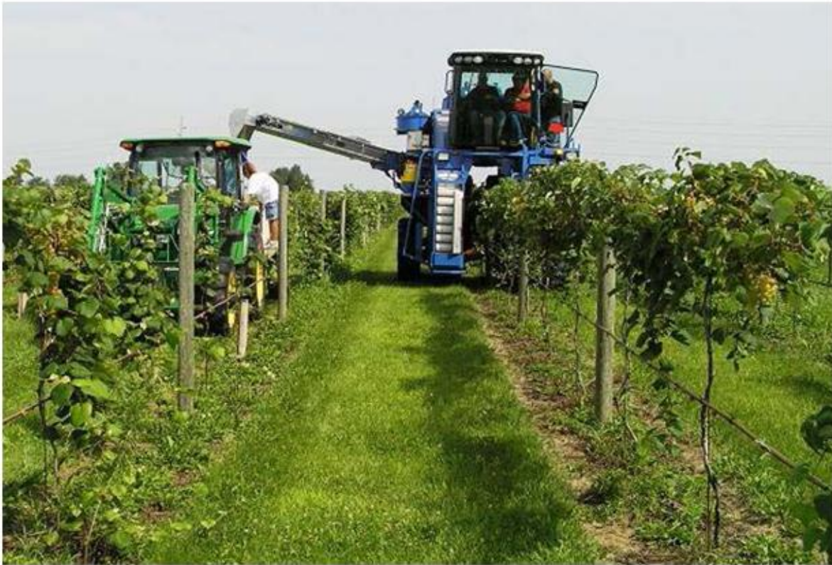
Figure 4. Korvan Self-Propelled Mechanical Wine-Grape Harvester

Korvan also manufactures and sells a mechanical berry picker for processing berries—largely for raspberries and blueberries. This machine is self-propelled and surrounds the row of berry bushes similar to the wine grape harvester. It does some damage to the fruit, but since it is going immediately for processing, this is not a serious problem.