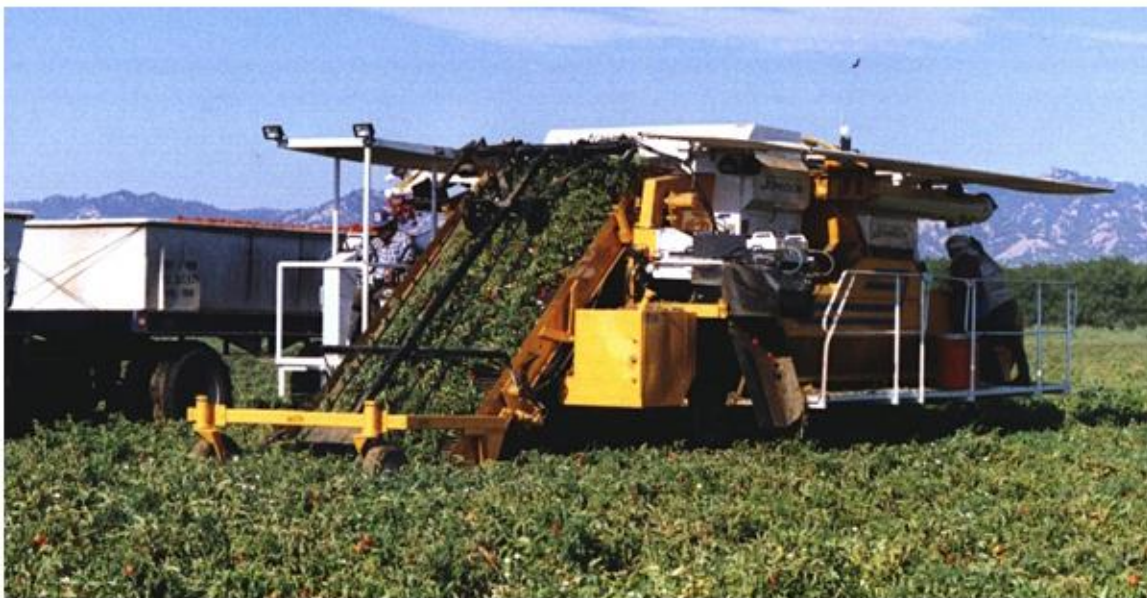
Figure 2. Self-Propelled Johnson Mechanical Tomato Harvester