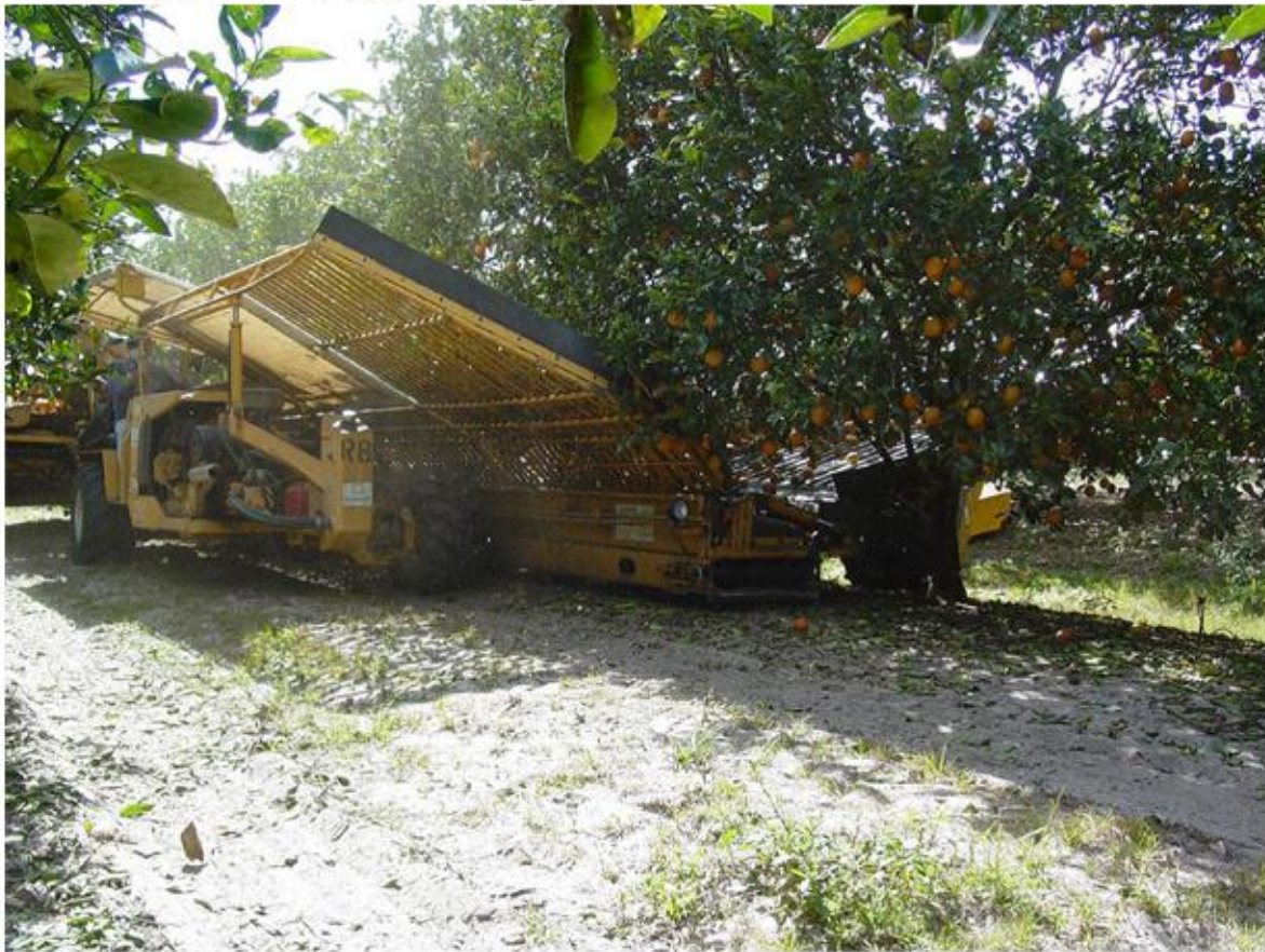
Figure 3. Coe-Collier Self-Propelled Trunk-Shaker and Catch Harvester of Florida Oranges

the second being a matching sloping table to aid with catching the falling fruit (Figure 3). The harvested fruit are conveyed into boxes.