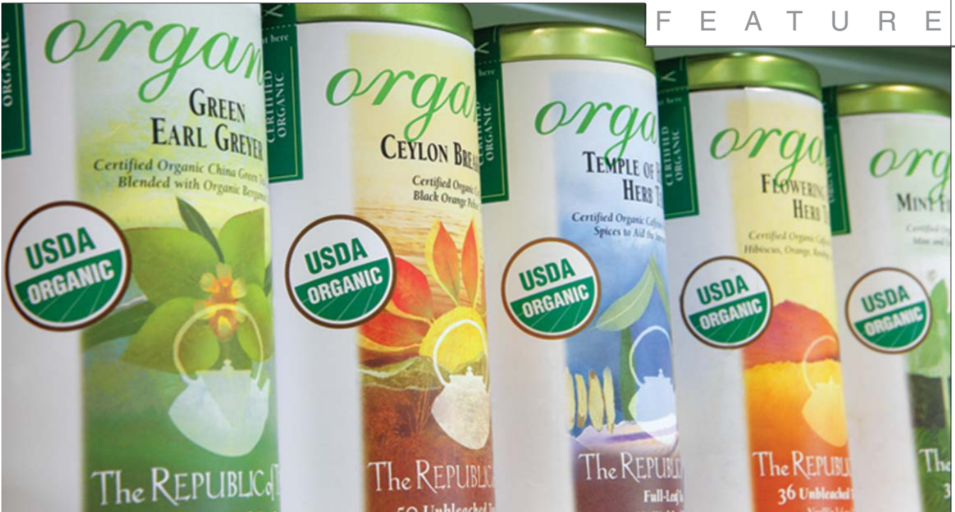
David Sparer; courtesy of My Organic Market

Although the organic market is growing in both the EU and the U.S., there are some problems with the flow of products to market. In Europe, the organic dairy and livestock industries, in particular, have grown rapidly over the last decade, and in some cases have outpaced the capacity of the market and distribution channels. Organic milk supplies in some regions were large enough to reduce organic prices, causing some producers to exit the sector because they were unable to turn a profit. The milk glut, however, appeared to be giving way to shortages in the UK, as demand continues to grow and supply has declined. The U.S. organic food market was formerly supply constrained, but now seems better able to meet consumer demand, especially for fresh produce. In the dairy market, however, with demand increasing rapidly, suppliers are struggling to provide enough organic milk to satisfy demand at current prices.