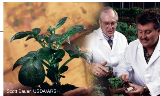
Scott Bauer, USDA/ARS

In June 2005, a U.S. interagency group met with representatives from Canada in Washington, DC, to discuss developments related to the International Treaty on Plant Genetic Resources for Food and Agriculture. The treaty governs the exchange of germplasm of 35 crops and 29