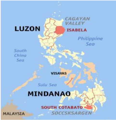
Figure 1. Survey Areas: Isabela and South Cotabato Provinces, Philippines