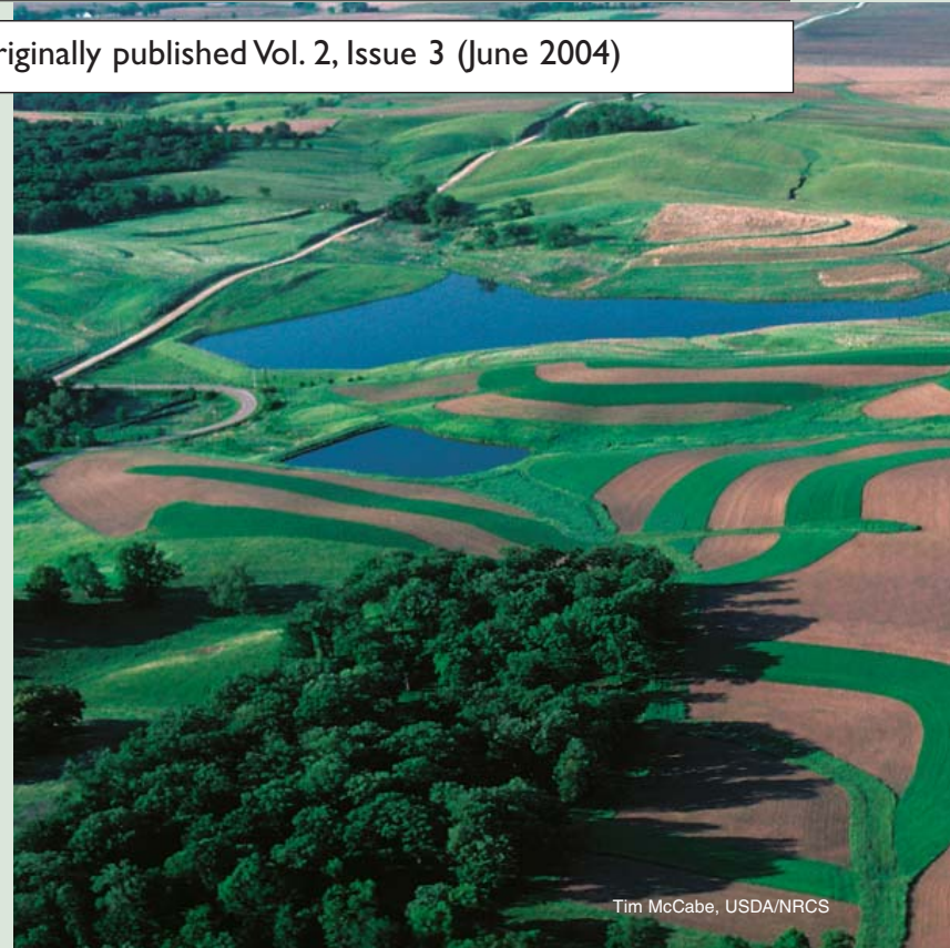
Tim McCabe, USDA/NRCS