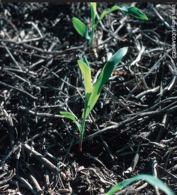
Lynn Betts, USNARS

Soil losses can be reduced through several means, including grassed waterways and conservation tillage.