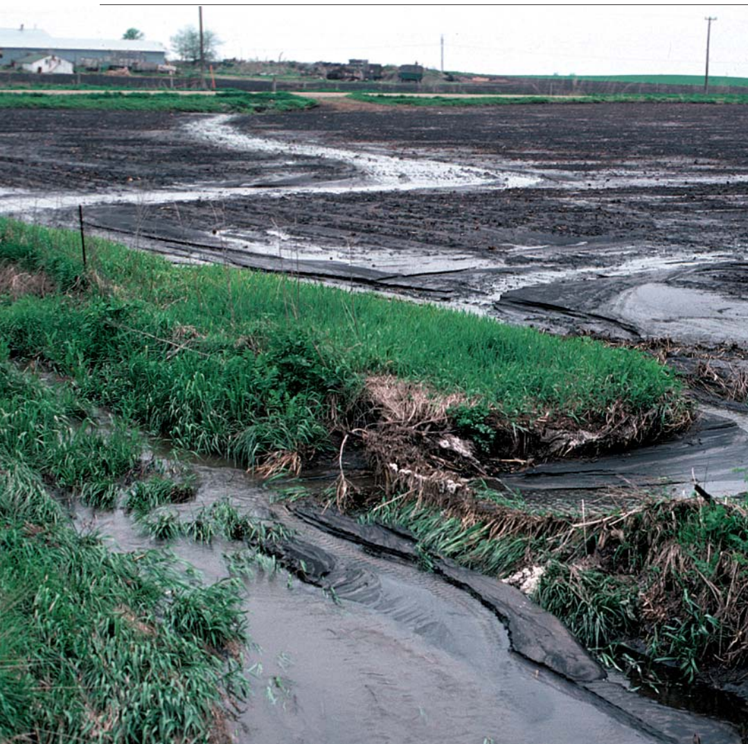
Lynn Betts, USDA/NRCS

Without protective measures in place, water and wind can lead to soil losses, which can harm farm fields and, through runoff, neighboring water bodies.