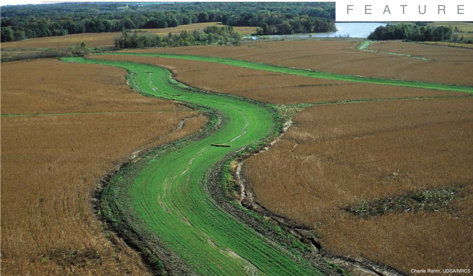
Charlie Rahm, USDA/NRCS