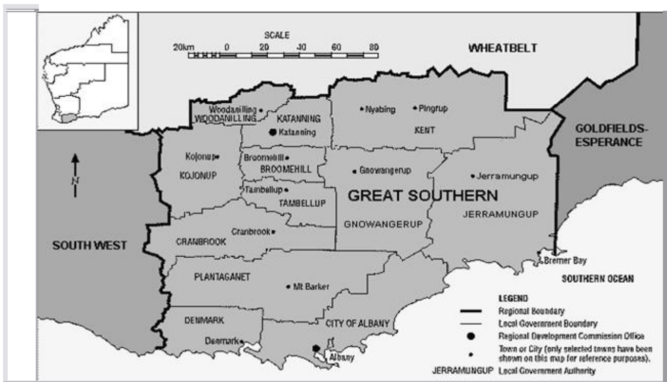
Figure 1. Map of the Great Southern Region of Western Australia with shire boundaries and town localities.

The focus of this study is on the Great Southern Region of WA (Figure 1) where around 40 per cent of the total Western Australian canola crop is currently produced (CBH 2003). As is typical for Australian broad acre production, Great Southern canola growers deliver 90-100% of their production to the local grain handling and storage firm Cooperative Bulk Handling (CBH), immediately following harvest (CBH 2003). Canola is delivered by the grower or a transport contractor to the CBH receival point in their local shire or to the larger port facilities as depicted in Figure 2. Based on global estimates of segregation it is expected that the cost of segregating GM and non-GM canola in this region from farm-gate to Albany Port will approximate world estimates of between 5 and 15 per cent of the producer price.