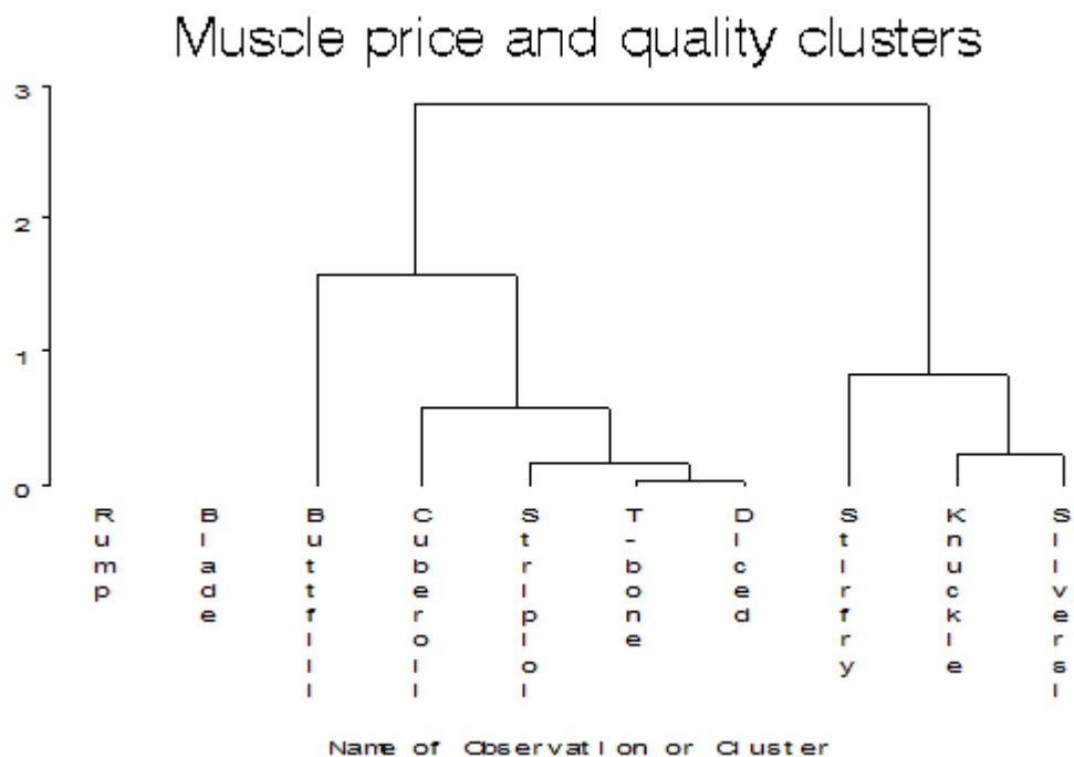
Figure 2 Clusters for muscles over log price and MQ4 scores

The variance-covariance matrix is used to produce groups of similar muscles across the two input variables. A hierarchical cluster tree is presented as Figure 2. That figure shows up to seven clusters working from one at the top to seven at the bottom of the figure. The vertical axis shows the unit distance between cluster groups. Clusters that are similar are closer together vertically and those further apart are dissimilar. Hence T-bone and diced meat are similar whereas cube roll and butt fillet are dissimilar.