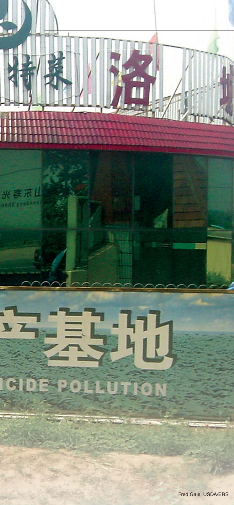
Fred Gale, USDA/ERS