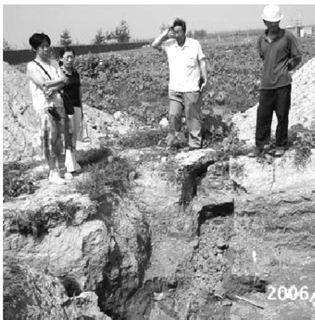
Figure 3. Ground cracking resulting from over-exploitation of groundwater, Hengshui region, Hebei Province