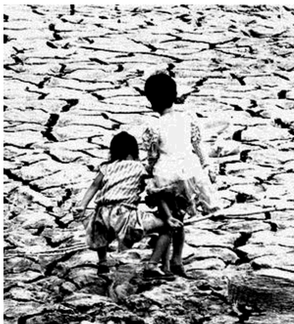
Figure 4. The bed of a dried-up lake

The main sources of water pollution are industrial and municipal wastewater, chemical fertilisers,