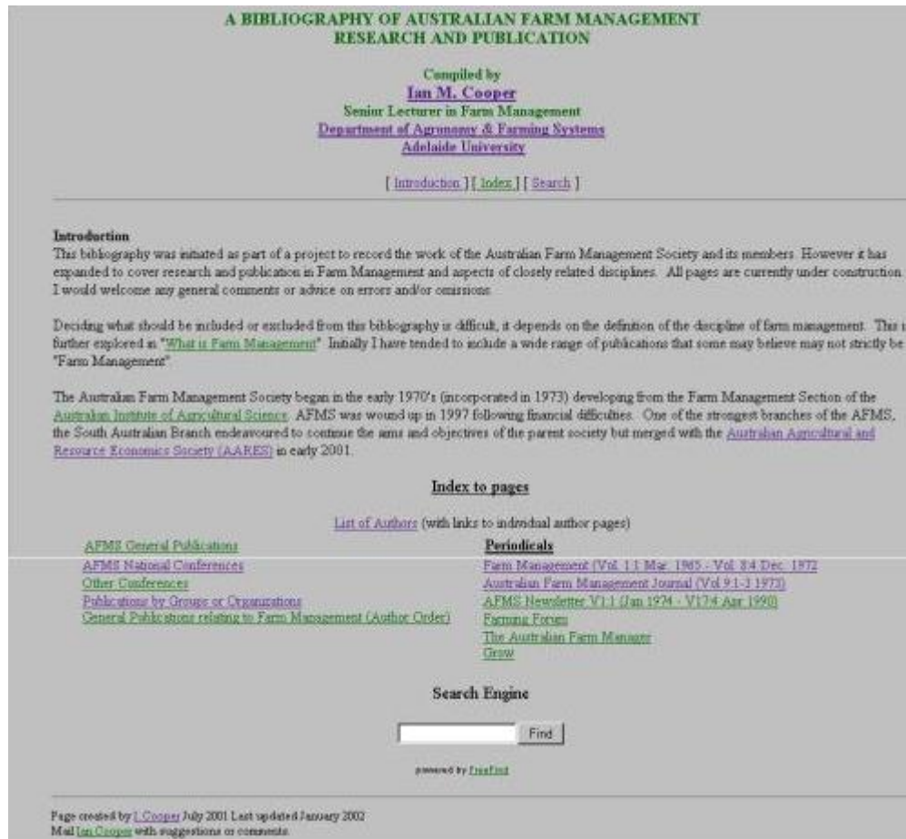
Fig 1 "Home" page of the bibliography

The periodicals looked at trace the evolution of these publications in relation to farm management. The indexes of each of the issues are available and in some cases there are links to complete articles (where they are available).