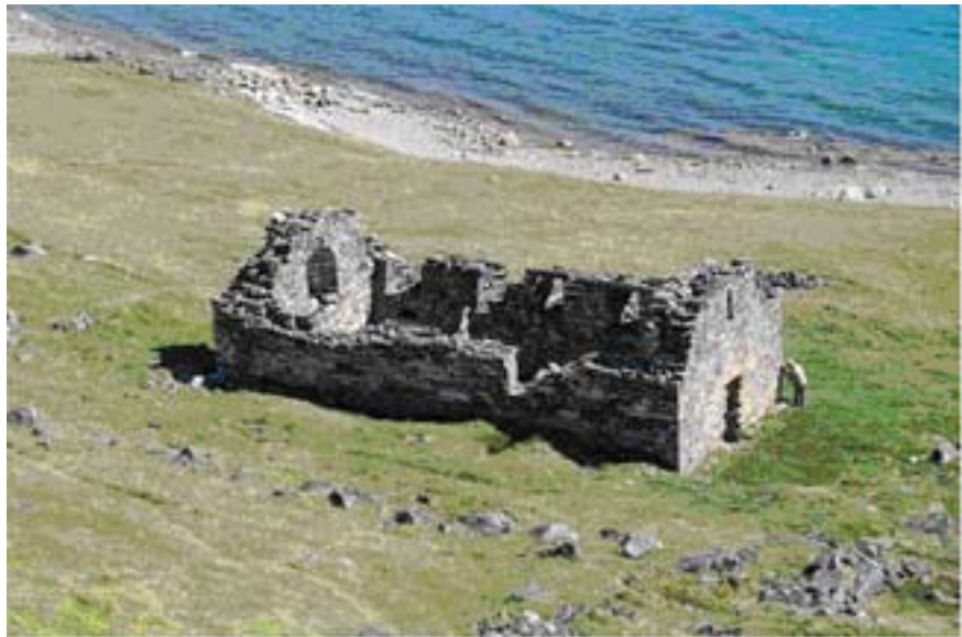
Figure 2. A church abandoned in Greenland some 600 years ago due to climate change

There is also no resource upon which nations and people are more interdependent. This interdependence is worldwide — data indicate that Italy where I now live and Ghana are equally dependent on crops that originated outside those countries. The dependence is at the varietal level and at the pedigree level of our modern crop varieties. Luckily, along with being the most important resource, crop diversity is among the easiest and cheapest to conserve. It's a matter of freezing seeds. Despite the simplicity, though, we