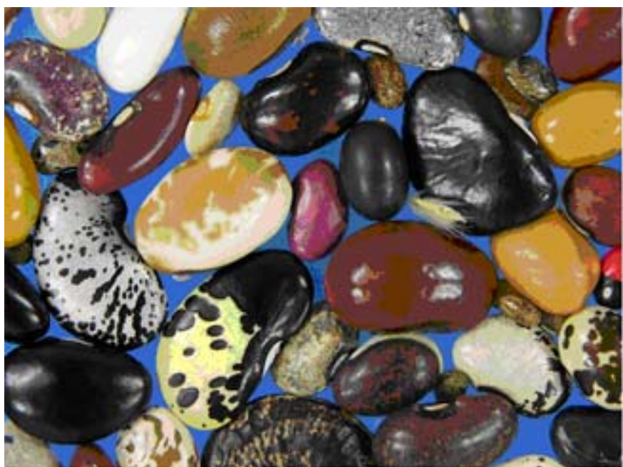
Figure 3. Great diversity is evident in this sample of beans

have no efficient coordinated global system for conserving this most valuable natural resource.