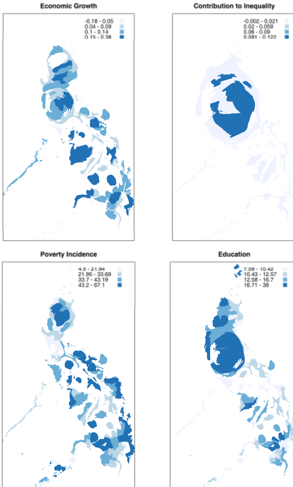
Figure 1: Spatial distribution of economic growth, inequality, poverty incidence and educational attainment. Gray indicates provinces with missing data or Laguna de Bay.