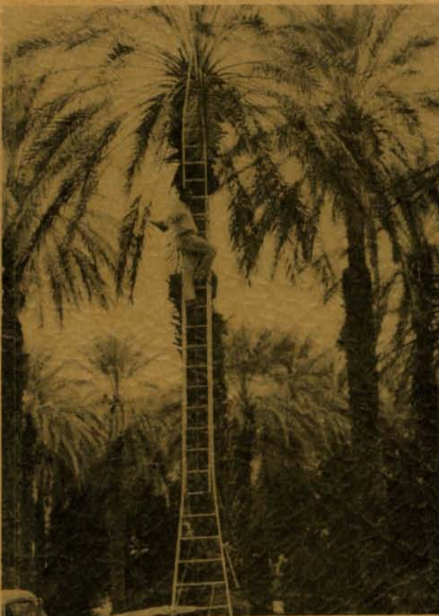
Date Harvest, Death Valley