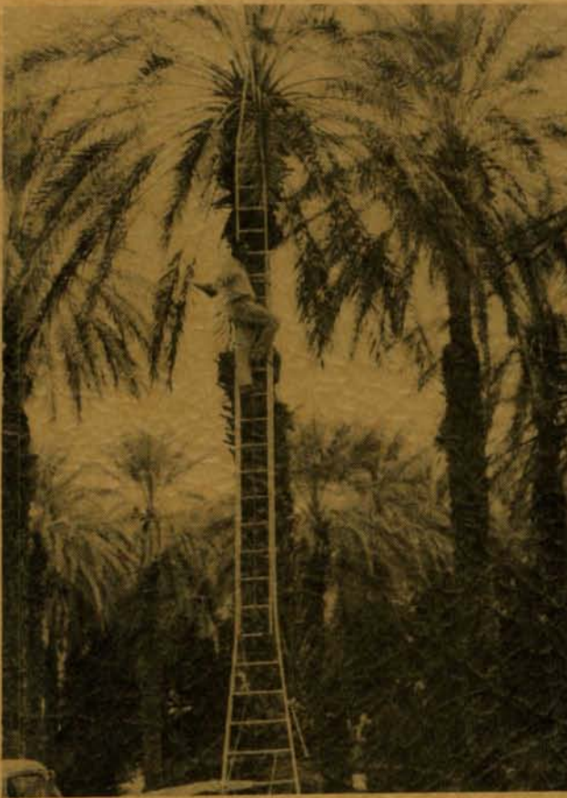
Date Harvest, Death Valley