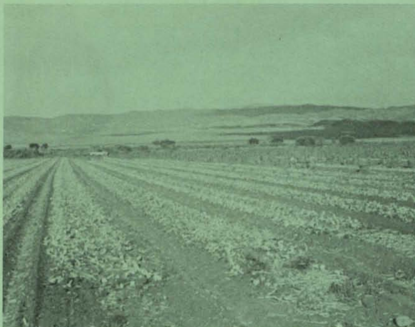
Garlic Harvest - Coleville