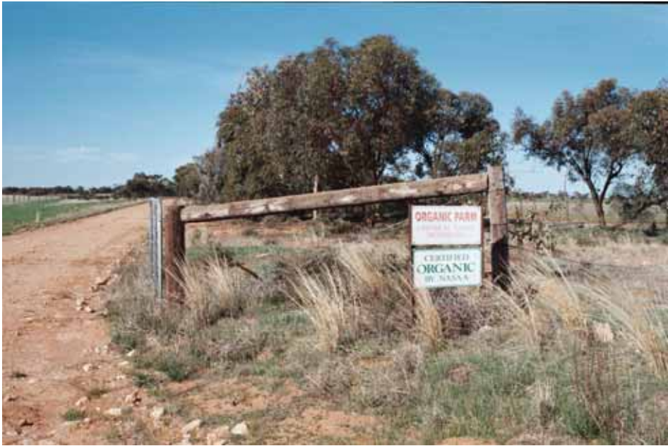
Plate 1: Sign at the border of an organic wheat farm, stating “chemical usage prohibited”