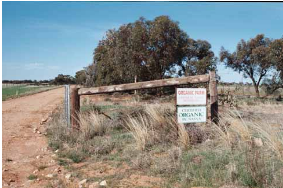
Plate 1: Sign at the border of an organic wheat farm, stating "chemical usage prohibited"