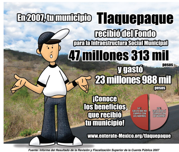
Figure 1: Example of Flyer

Notes: The flyer was folded in half. The upper image is the front and back of the flyer, the lower image is the inside of the flyer.