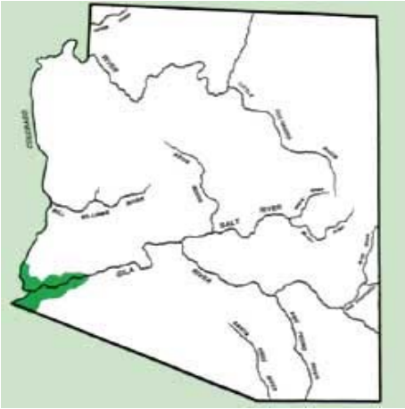
Figure 9.1. Lettuce Production Region of Arizona

The cooperating grower is a large lettuce producer in Yuma County, right in the heart of the prime vegetable growing region. The grower provided the following costs of production as a baseline comparison, which were the actual costs of production for the 2005-06 growing season for 1,563 acres of lettuce.