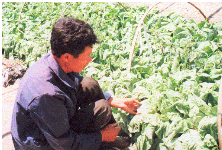
Photo 2. A vegetable farmer says that he has never seen this kind of insect. ( the insect ever emerged 10 years before, according to local IPM scientists )