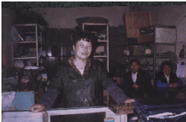
Photo 9. A pesticide retailer interviewed in Sanbao village