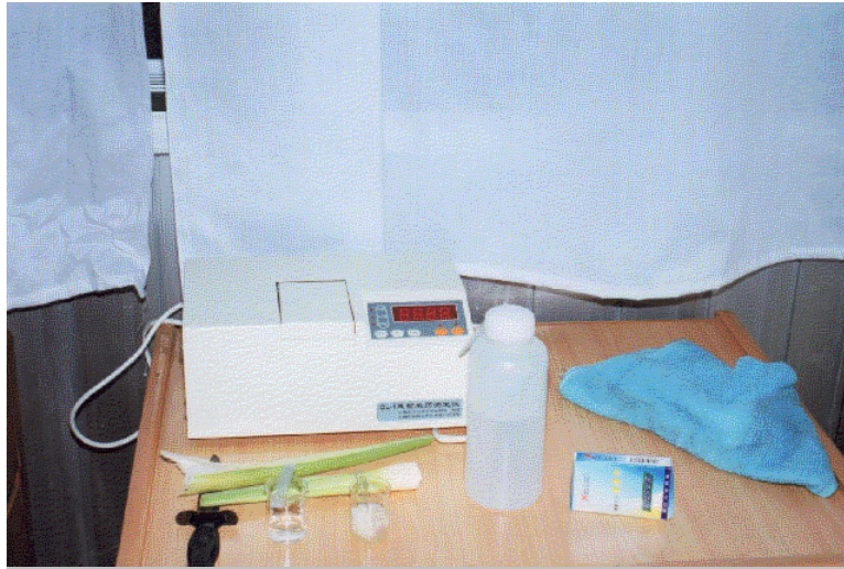
Photo 7 Instruments for PHPDK test in Sanliting vegetable market