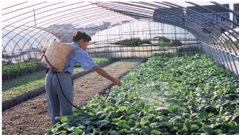
Photo 3. A male vegetable farmer is spraying with traditional knapsack