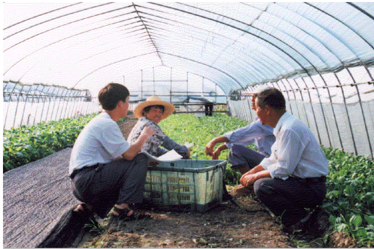
Photo 4. An interview with farmers who are working in vegetable field