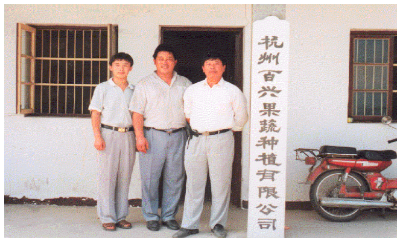
Photo 5. Interviewer with the managers of Baixing Ltd. Vegetable and fruit