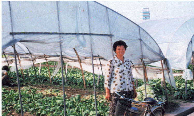
Photo 1. A female vegetable farmer who is more than 50 years old