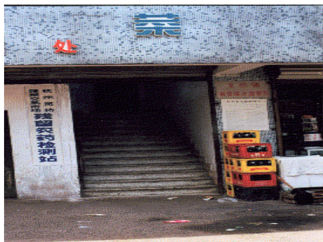
Photo 6 PHPDK test office in Jianqiao vegetable market